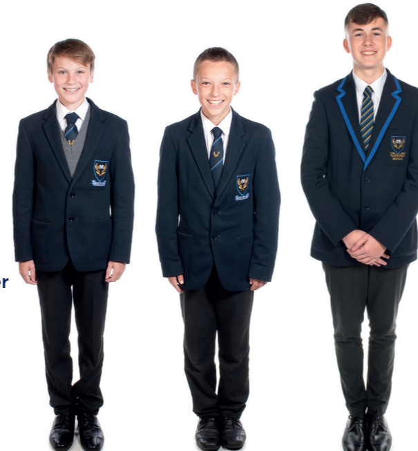
Winter Uniform Summer Uniform Sixth Form Uniform