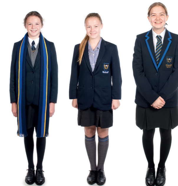
Winter Uniform Summer Uniform Sixth Form Uniform

What's required... Navy Blue Blazer Laurelhill College jumper Dark Grey Trousers* College Tie White Shirt Grey/Black Socks Black Leather Shoes